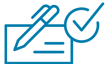
Checking and Savings Account Statement Balances as of FAFSA Filing Date