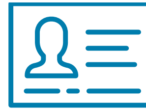
Student & Parent Federal Student Aid Account (FSA ID)