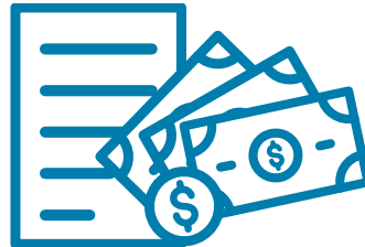
Federal Tax Returns and W-2's (2019)